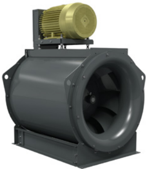
Arrangement 9 Horizontal Mount