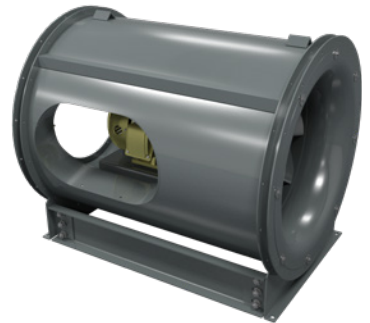
Arrangement 4 Bifurcated