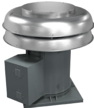
Supply / Exhaust