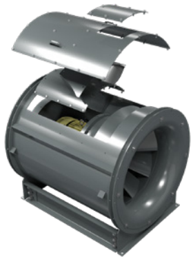
Arrangement 4 Dual Door