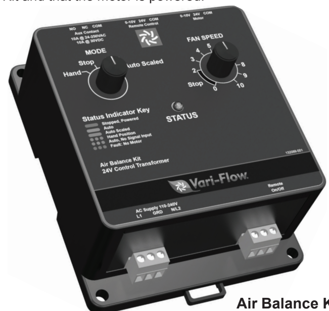
Air Balance Kit