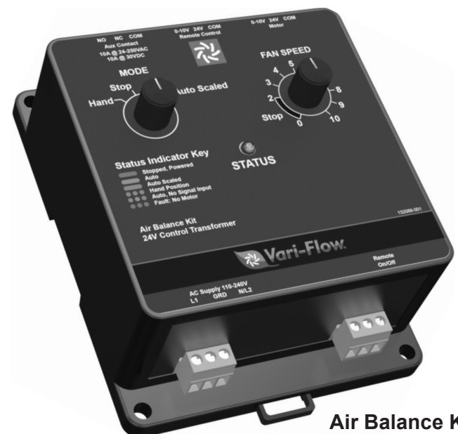
Air Balance Kit